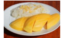
Mango with Sticky Rice