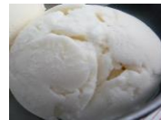
Coconut Ice cream